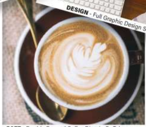
CAFE - Freshly Brewed Coffee Dine-in Or Take-away