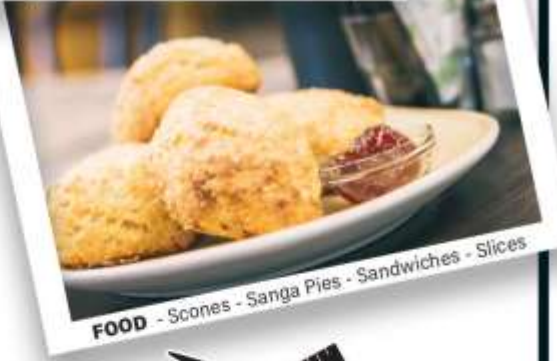
FOOD - Scones - Sanga Pies - Sandwiches - Slices