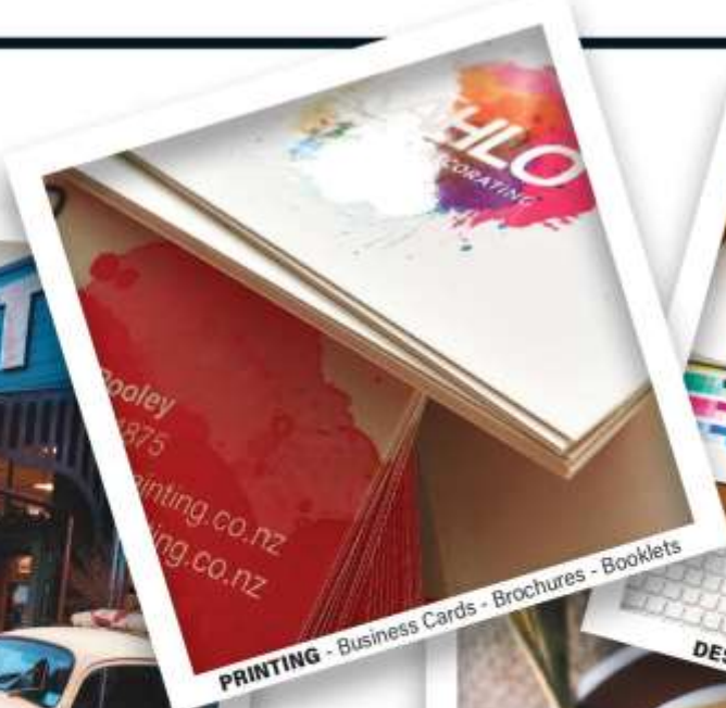
PRINTING - Business Cards - Brochures - Booklets