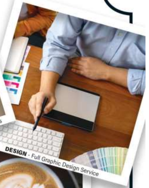
DESIGN - Full Graphic Design Service