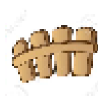
Build a Fence